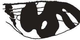
Black cherry fruit fly