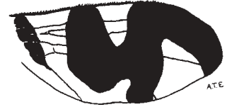
Walnut husk fly